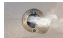
Can be cut into any type of sectional door. Available in select sizes.