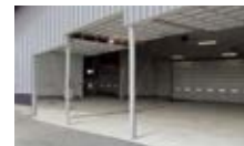
Carry-away, roll-away or swing-up mullions are available on select sizes.