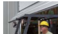
Single section and double sections available on select sizes.