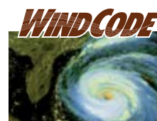
WindCode® reinforcement available up to W1 design pressure (DP) 14 PSF, depending on size. Doors tested 50% greater than DP.