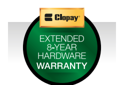
Upgrade your standard door with industrial-grade components.