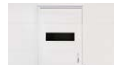
32" wide x 80" high (.81 m x 2.3 m), max 16'2" (4.9 m) wide section.