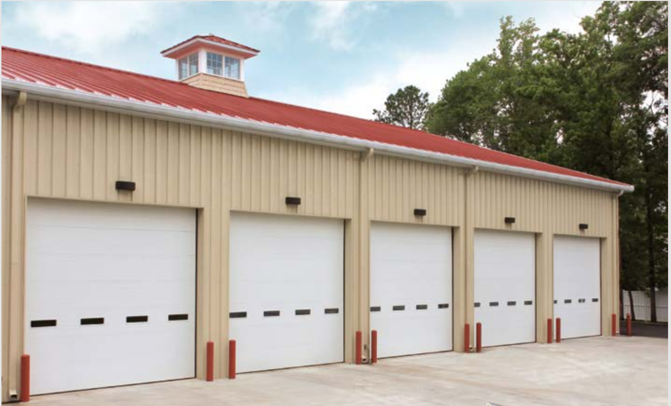
Model 3724, 14'2" x 14' Doors; Shown with 24" x 8" Lites